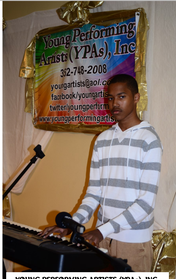
YOUNG PERFORMING ARTISTS (YPAs), INC.

YPAs, Inc. has featured its members in numerous showcases from Panama City Beach to Jacksonville to Orlando to Tampa. Young artists entertainment is professional, high quality and a step above a “talent show.” YPAs, Inc. & TSO has developed a reputation among schools, educators, presenters, organizers, colleges, universities, churches and communities as supporters and presenters of “The Arts”!